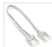
TAPE-TO-TAPE: 6IN JUMPER COB CONNECTOR