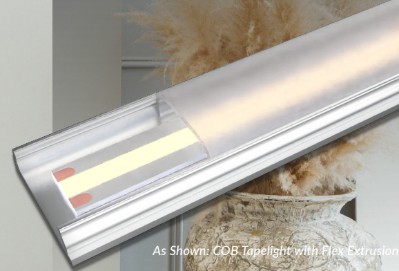
As Shown: COB Tapelight with Flex Extrusion