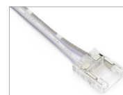
TAPE-TO-WIRE: 6IN WIRE COB CONNECTOR