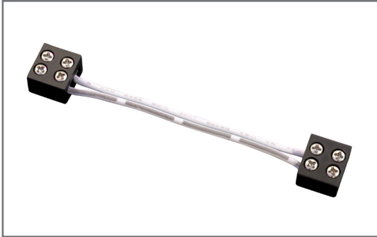
Connects 2 LED sections with 3" or 6" wire (wire and connectors included, LED tapelight sold separately)